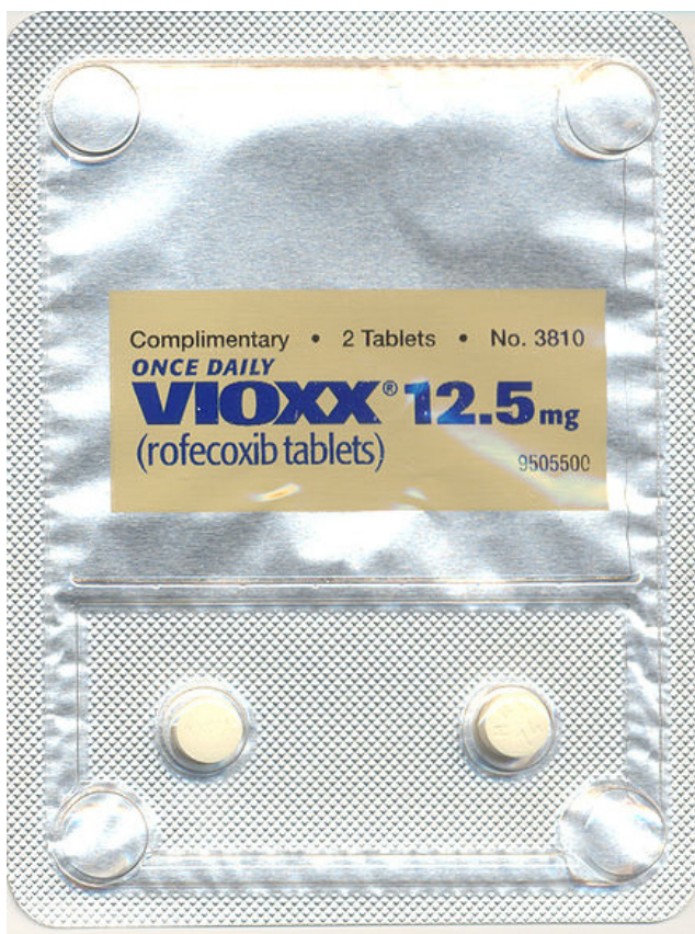
Photograph of Vioxx sample pack