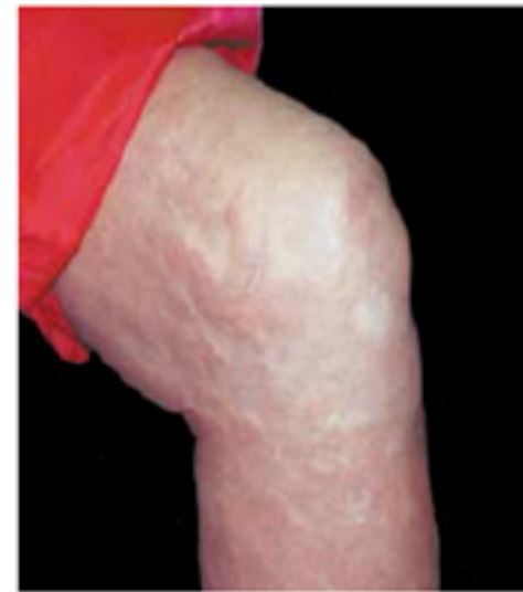
Figure 1: A 31-year-old woman with a haemodialysis-associated cutaneous fibrosing disorder.

Since March, 1997, we have identified 15 renal-dialysis patients in California, Michigan, Ohio, and Mississippi,